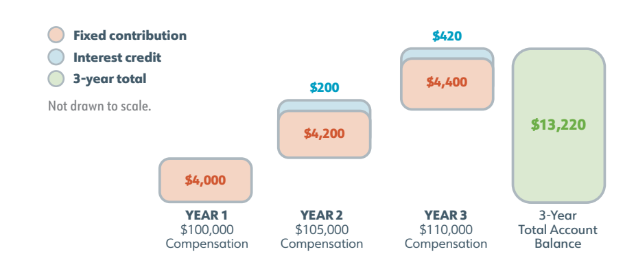
Exhibit 2: This highlights potential contributions under a combination 401(k) and cash balance plan.

Asset accumulation in cash balance plans can become an important part of an individual's retirement planning. The maximum annual dollar amount that may be credited is related to the age of the participant, and can potentially exceed $2 million in some circumstances.<sup>1</sup>